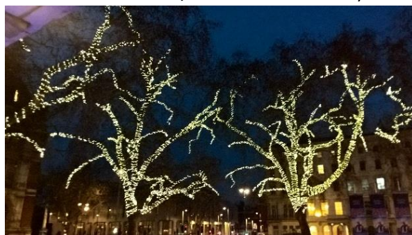
Ice Skating 2018

At the end of October we attended Scarefest at the home of Scouting Gillwell Park with 7 of our scouts attending.