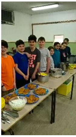
Cooking Camp 2019

In February we visited a scout hut in East London for a very well attended cooking camp. The scouts produced some fantastic food and we hear that they have continued cooking at home as well!