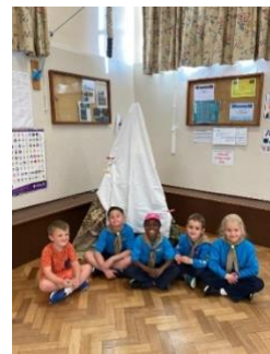
Above: Making Teepees

Badge work at home: The Beavers all like to earn badges, so support at home can help them finish badge requirements that are less easy in Beaver meetings. An example of this is the Cook badge. We had one last online zoom meeting where we made cake in a cup. A number of Beavers completed the other cooking requirements with parents at home. Some have also done experiments at home as well as the Experiments Badge work we've done together, for example.