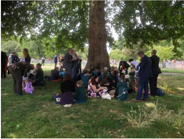
We had a picnic after the event