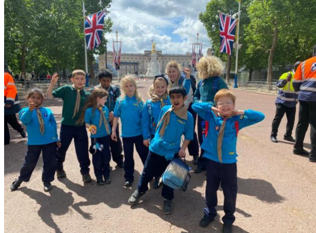
In front of Buckingham Palace on our way home